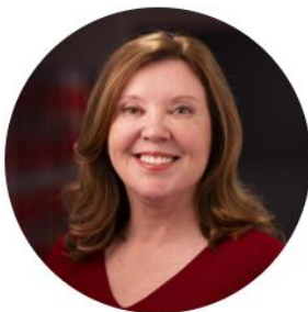
Dame Rachel de Souza Children's Commissioner for England

About this survey : The Big Future survey - have your say!